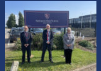
Mr Hirst had a meeting with the Department of Education to discuss the new plans for our exciting new building plans.