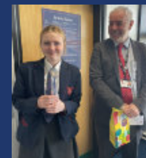
Presenting 'The Immortal Instrument'...