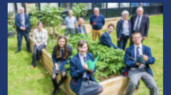
Retirement will be handy to flex those green fingers...